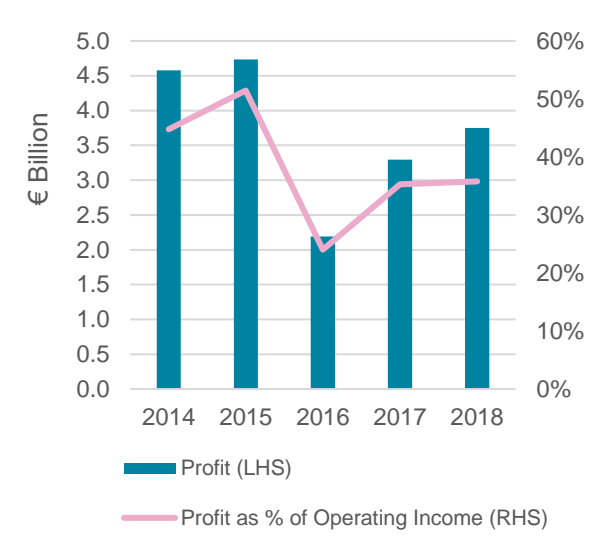
Chart 4: Total Profit after interest and tax and Operating Profit Ratio