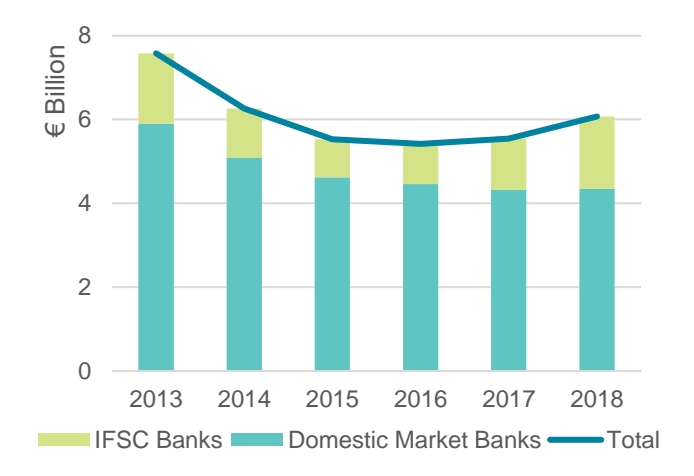
Chart 2: Interest Payable on Loans and Deposits by Bank Type, 2013 – 2018