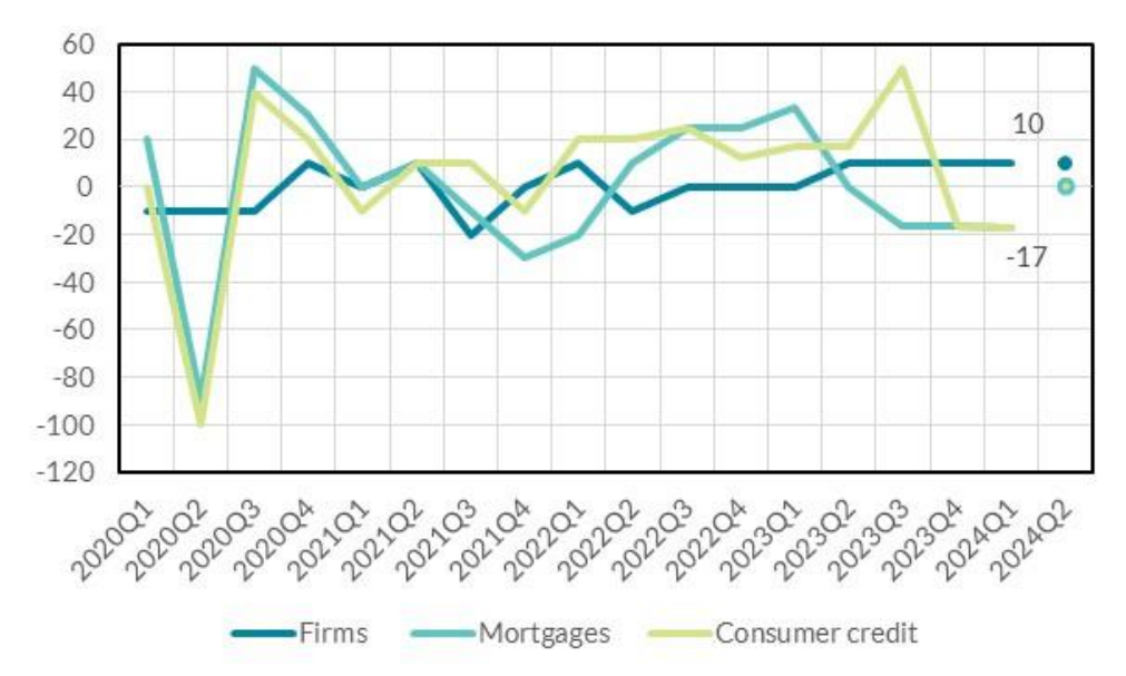
Figure 2. Demand for firm and household lending, (Diffusion index).

Lines refer to backward looking changes to credit standards, circles refer to expected changes in credit standards next quarter. Firms and consumer loans have the same forward looking value (0), while mortgages lending has a value of 17. Values above zero refer to a net tightening of credit standards. The diffusion index gives responses which relate to "tighten (ease) credit standards somewhat" a lower weight than those which refer to a "tighten (ease) credit standards considerably".