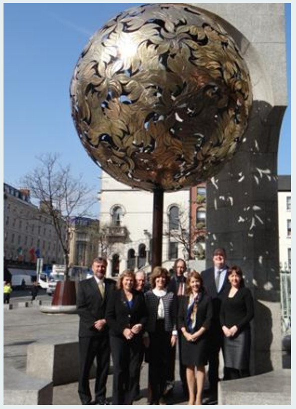
The ICURN Peer Review Team with members of the Registry of Credit Unions outside the Central Bank during their on-site visit in April.

It is planned to publish the peer review report, which will include the findings and recommendations on the Central Bank's performance of its functions in relation to credit unions, in September. Details will be provided to credit unions at that time.