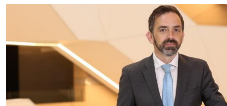
Ed Sibley, Deputy Governor